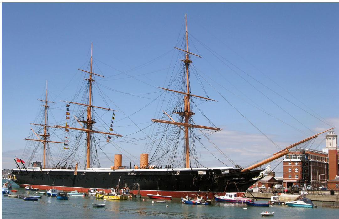
Above: HMS Warrior