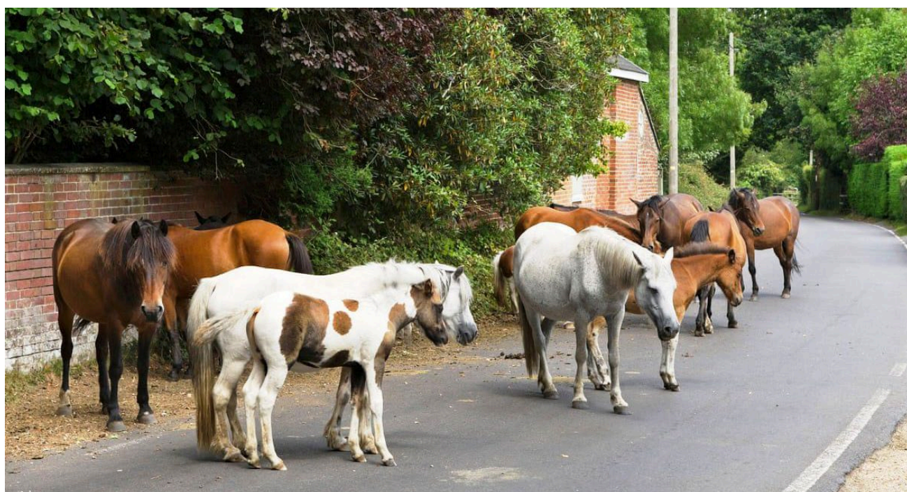
Above: New Forest Traffic Calming

Friday, September 12 th . Departure for home.